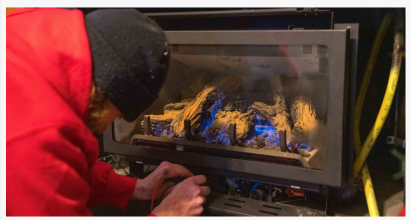
Heating Services Saskatoon