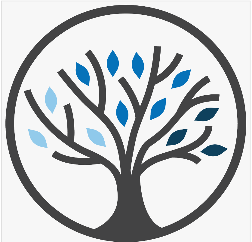
Changes Healing Center offers accredited dual diagnosis and addiction treatment