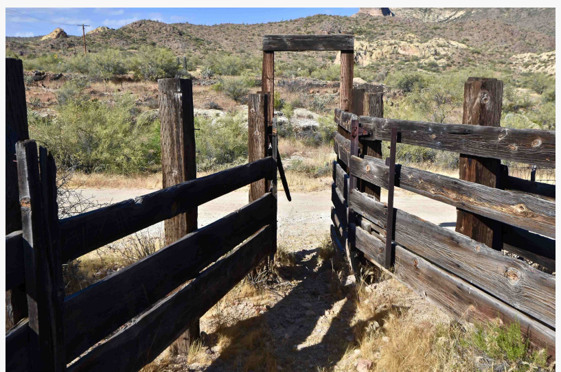
Cattle Chute or Closed Party Primaries

Combative Congress addresses a serious and complex topic in ways that make reading it pleasant. This nonpartisan book is unique in that its appeal stretches from a high school student to a professor, from a young woman to a retired chemical engineer, and more. It was written to be concise and readable with some humor; it has 33 color graphs and photographs to implant