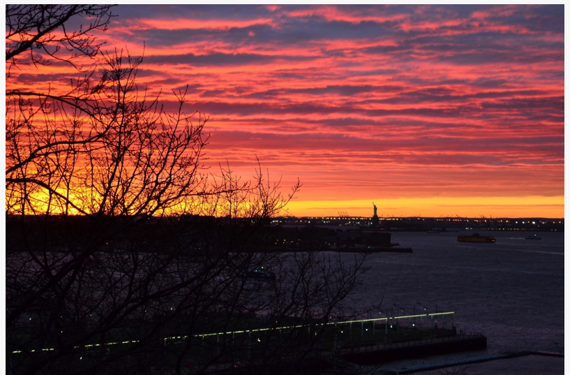
The Statue of Liberty