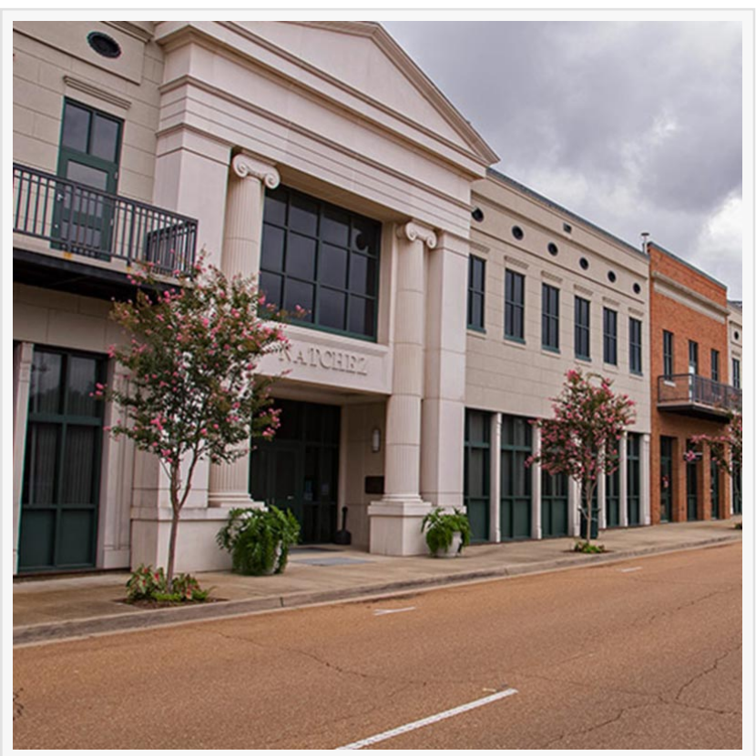
An entrance to the Natchez Convention Center as seen from Main Street in Downtown Natchez.

The first phase of the renovation, currently underway, focuses on the 18,000 square foot exhibit hall, the centerpiece of the 32,000 square foot facility. This phase includes a comprehensive top-to-bottom transformation, featuring fresh paint, new carpet, exquisite trim work, and wall coverings to enhance the convention experience. The goal is to