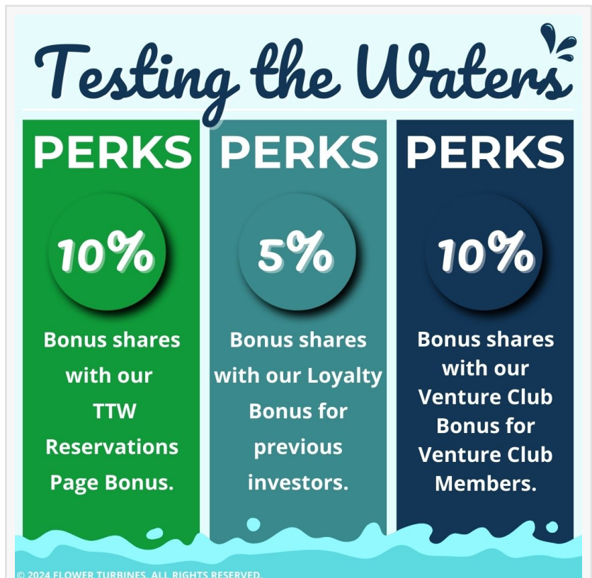
Perks During TTW Share Reservations