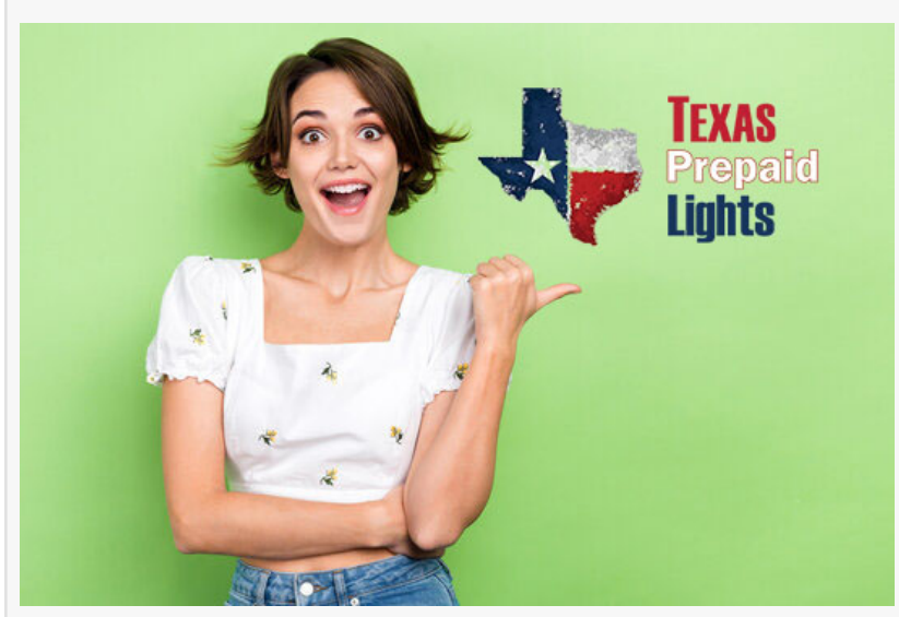
Electricity In 1 to 3 Hours