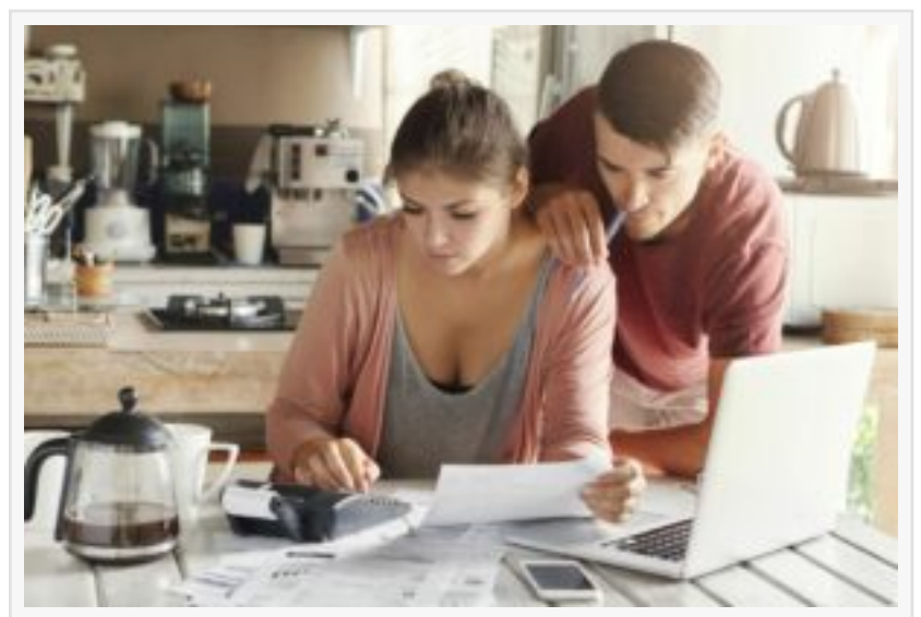
Take Control of Your Electric Usage