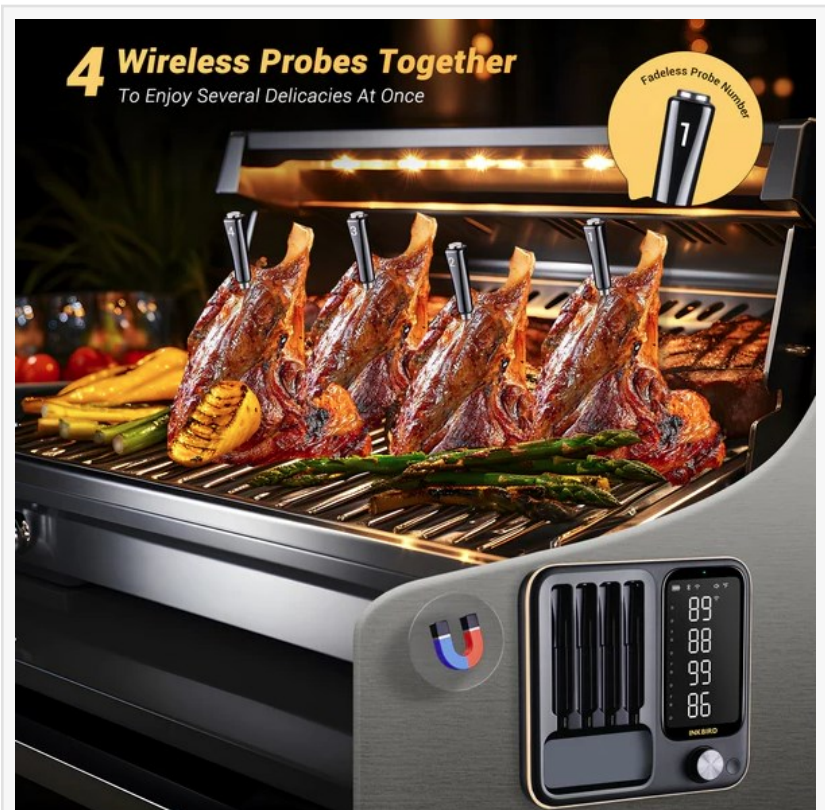
4 Probes to Cook Together

- Historical Temperature Data for Advanced Analysis: The INT-14-BW stores 30 minutes of temperature history and syncs with the INKBIRD app when connected, allowing cooks to track and analyze their cooking progress.