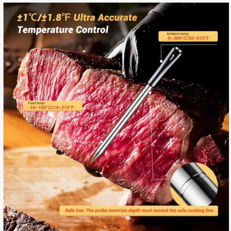
Accurate Temperature Control