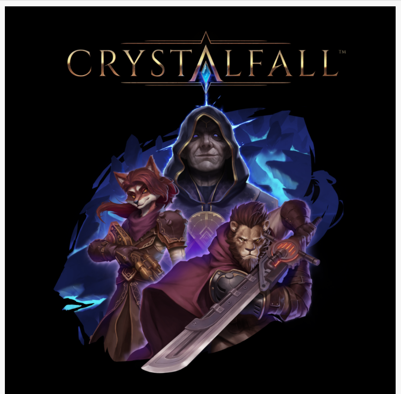
Crystals of Naramunz coming to Gamescom 2024 with new game name Crystalfall

Aethereals are the strongest items in the game, infused with the power of crystals and boasting unique properties. Players who wish to trade them outside the game can seal them at a special merchant, allowing them to survive the seasonal resets and become tradeable on the open market.