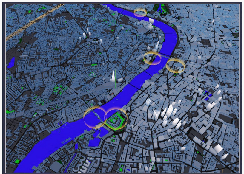
Energy Consumption Monitoring of Heritage Buildings