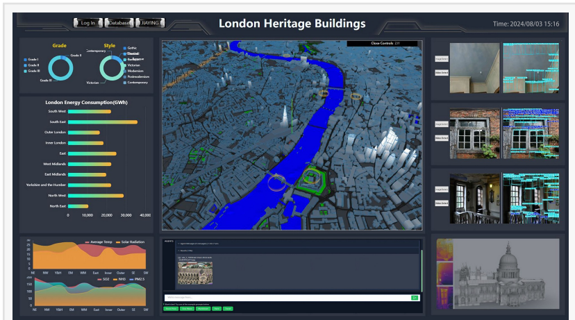
City-Level AI Digital Twin Platform for Heritage Buildings in London

The UK is renowned for its rich architectural heritage, featuring diverse styles such as Gothic, Romanesque, Baroque, and Victorian. These structures reflect various cultural characteristics from different historical periods. The UK government strictly protects heritage buildings and emphasizes their adaptive reuse to meet modern needs while providing the public with a wealth of cultural resources. However, the addition of modern equipment has significantly increased the energy consumption of heritage buildings. Furthermore, climate change, rising sea levels, and extreme weather events pose environmental challenges to heritage buildings in London. To tackle these challenges, Dr. Jiaying ZHANG has