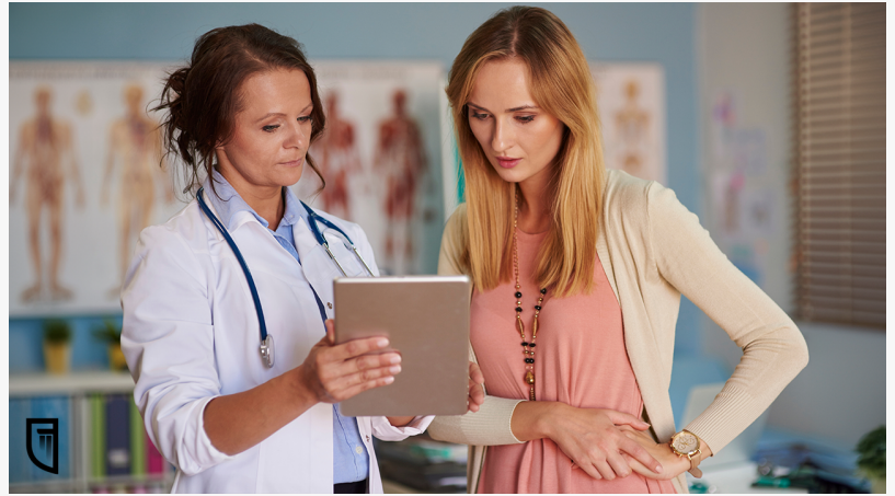
pfas exposed worried woman

LegalClaimAssistant.com was founded with the mission of making legal assistance accessible to