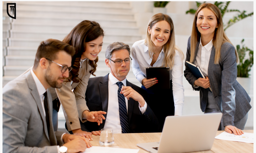
pfas lawsuit lawyers