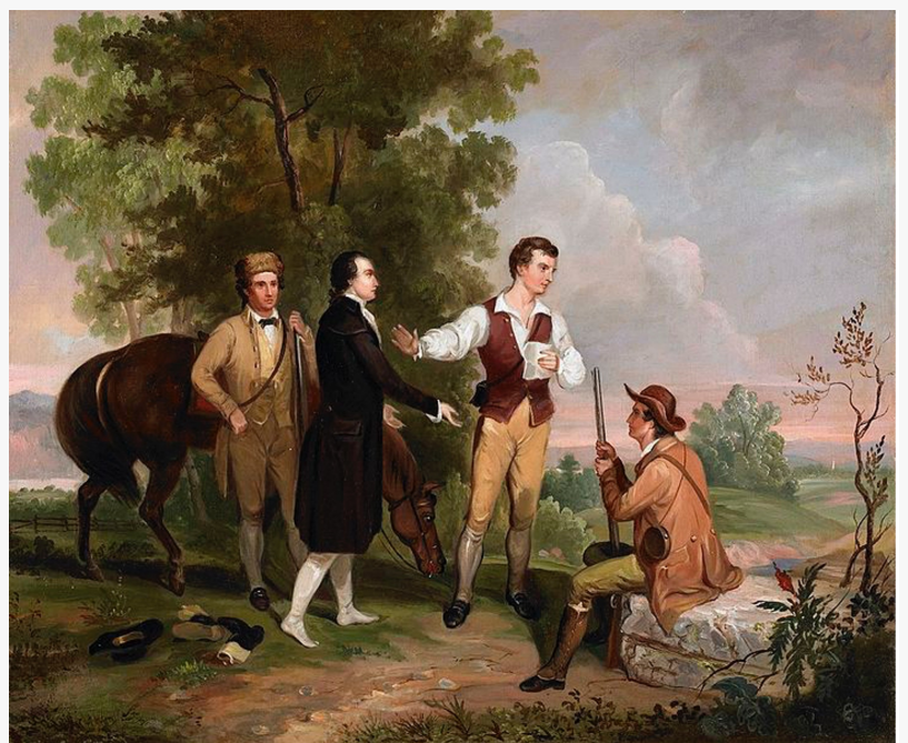
"The Capture of Major André," by Asher Brown Durand (1845).

It was a very much a "treason of the blackest dye" (as described in General Nathanael Greene's orderly book that will be on display) that began to unfold as midnight arrived on September 22, 1780. Meeting secretly, General Benedict Arnold turned over plans and troop specifications for West Point to British spy Major John André. With the plans, which André concealed in his boot as he made his way through Westchester County toward New York City, the British might have captured West Point and turned the tide of the war. Instead, André was captured on September 23rd by three local militiamen in Tarrytown and Arnold's plot was uncovered. General George Washington, who had been one of Arnold's most ardent supporters, would famously say in