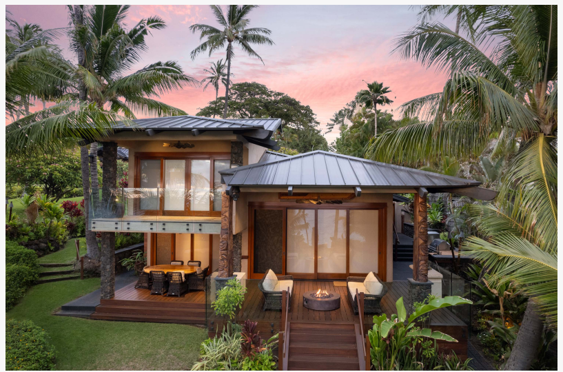
A private tropical haven with two gated entrances and private access

Concierge Auctions is the world's best luxury real estate auction marketplace, with state-of-the-art digital marketing, property preview, and bidding platform. The firm matches sellers of one-of-a-kind homes with some of the most capable property connoisseurs on the planet. Sellers gain unmatched reach, speed, and certainty. Buyers receive curated opportunities. Agents earn their commission in 30 days. Acquired by Sotheby's, the world's premier destination for fine art and