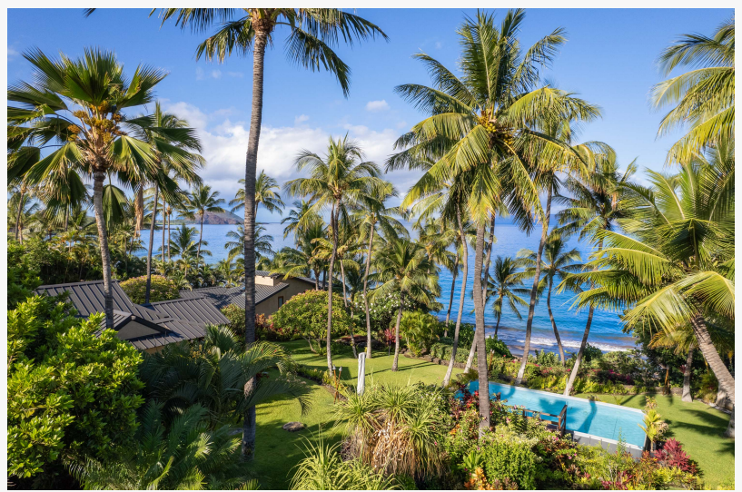
Four meticulously designed buildings with a combined seven bedrooms

luxury goods, and Anywhere Real Estate, Inc (NYSE: HOUS), the largest full-service residential real estate services company in the United States, Concierge Auctions continues to operate independently, partnering with real estate agents affiliated with many of the industry's leading brokerages to host luxury auctions for clients. For Sotheby's International Realty listings and companies, Concierge Auctions provides Sotheby's brand exclusivity as Sotheby's Concierge Auctions. Since inception in 2008, the firm has generated billions of dollars in sales, broken world records for the highest-