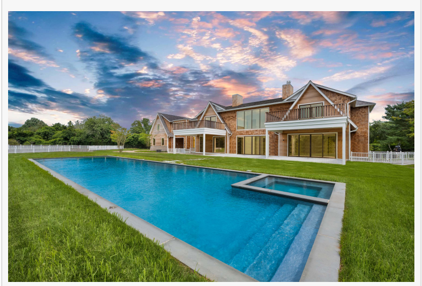
Located in Southampton's exclusive Fordune enclave, once part of Henry Ford II's 250-acre estate, on a quiet cul-de-sac

The Estates offer close proximity to Southampton Village's Main Street and magnificent ocean views. Southampton, a renowned coastal city, famous for its splendid hiking trails, delectable cuisine, and renowned surfing spots, seamlessly blends a quaint small-town atmosphere with easy access to upscale shopping, fine dining, and unforgettable experiences. Iconic landmarks like the Southampton Pier invite leisurely strolls, while the local shops provide a premier shopping destination.