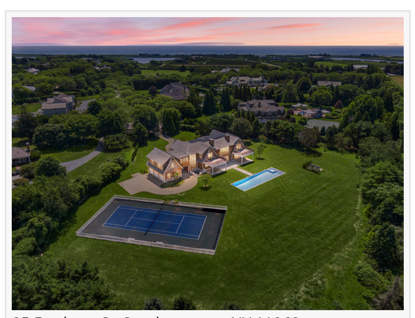
25 Fordune Ct, Southampton, NY 11968

NEW YORK, NEW YORK, UNITED STATES, August 15, 2024 /EINPresswire.com/ -- A breathtaking, nearly three-acre estate in the exclusive Fordune Estates enclave of Southampton, New York, is set to hit the auction block next month via Sotheby's Concierge Auctions in cooperation with Harald Grant and Bruce Grant of Sotheby's International Realty – Southampton Brokerage.