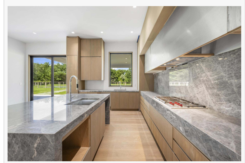
Designed on spec with marble, oak, and glass (a rare new build)

room, and three-story elevator. Top-of-the-line finishes can be found throughout, including oak flooring, a gourmet kitchen with Gaggenau appliances and Dornbracht faucets, and Marvin Windows that frame stunning landscape views. Outside, the allure of coastal living continues with a large entertainer's patio, an ideal setting for al fresco dining and gatherings.