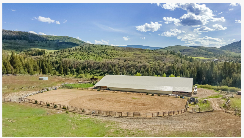
Working equestrian destination and regulation riding arena

3758 Salt Creek Road is available for private showings by appointment, in person or virtually.