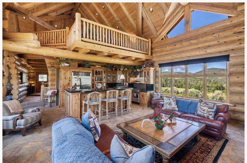
Luxury lodge aesthetic with natural stone and hardwoods