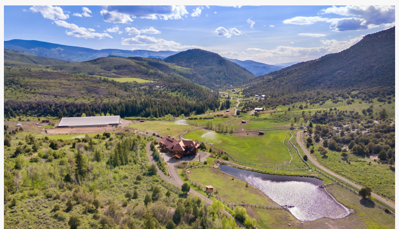
Salt Creek Ranch, 3758 Salt Creek Rd., Eagle, CO

a sprawling property located in Eagle, Vail Area, Colorado, is heading to auction next month via Concierge Auctions. The exceptional estate, featuring a custom-built lodge-style home, a matching guest cabin, and