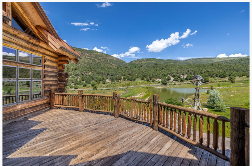
162 acres with creek frontage and senior water rights