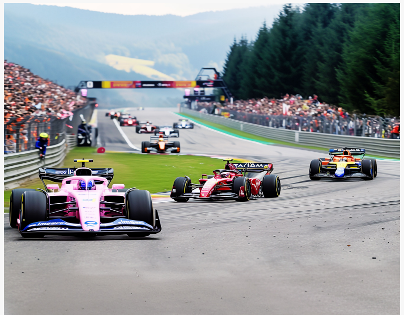
Formula 1 Calendars

A Formula 1 Calendar That Truly Fits Your Brand