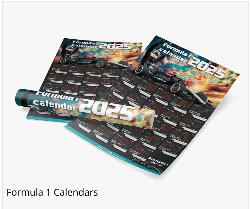
Formula 1 Calendars