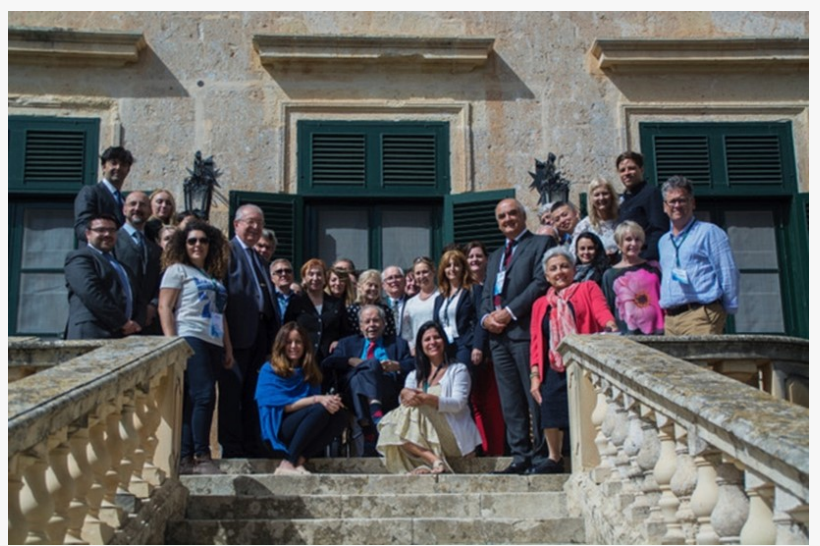
Edward de Bono (centre) outside his Palace of New Thinking in Malta

This press release can be viewed online at: https://www.einpresswire.com/article/735818406