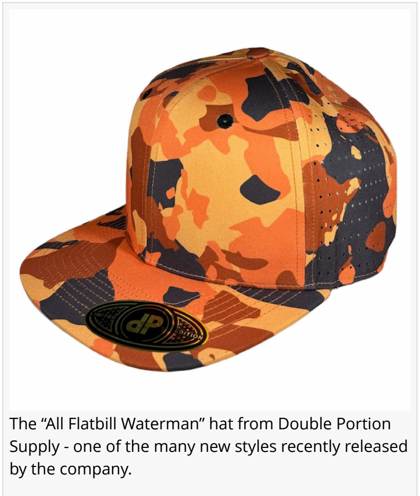
The "All Flatbill Waterman" hat from Double Portion Supply - one of the many new styles recently released by the company.

KIHEI, HAWAII, UNITED STATES, August 15, 2024 /EINPresswire.com/ -- Double Portion Supply, a leading name in the custom snapback industry, is excited to announce the release of over 30 new cap styles and designs. This latest collection , which showcases the exceptional craftsmanship and attention to detail the company is known for, reaffirms Double Portion Supply's commitment to offering customers the highest quality custom caps. As a Hawaii-based snapback superstore, Double Portion Supply continues to set the standard for custom headwear and apparel, serving clients nationwide with beautiful products and unmatched customer service.