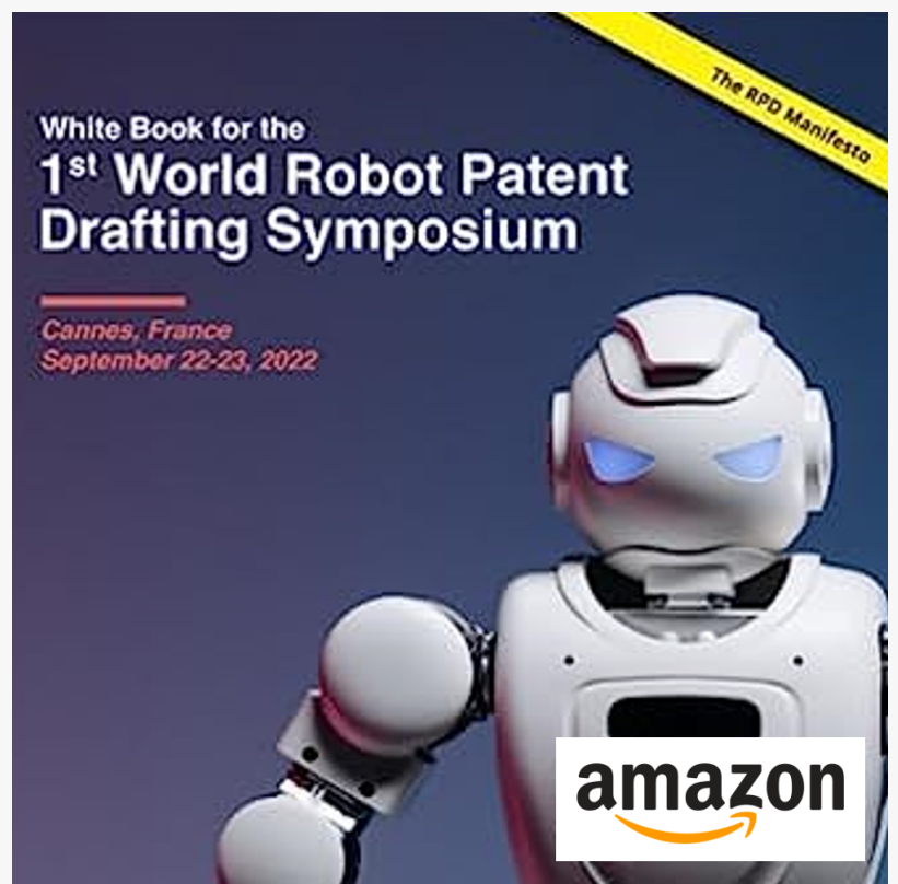
PowerPatent BioTechX First Draft solution for Patents