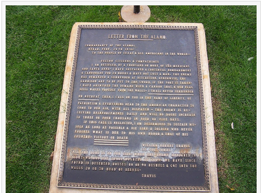
The Col. William Travis Alamo Letter in front of the Alamo Chapel in San Antonio

This press release can be viewed online at: https://www.einpresswire.com/article/736099018