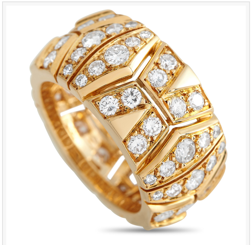
Cartier Rivoli 18K yellow gold diamond ring stamped 750. The diamonds, weighing 2.25 carats, allow this simple yet elegant ring to effortlessly catch the light (est. $5,500-$12,500).

Erica Anderson SJ Auctioneers +1 646-450-7553 email us here