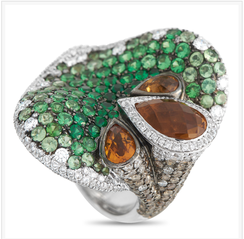
Maggiore ring from the Rhapsody Collection, made of 18K white gold and with a design that consists of brown diamonds, white diamonds, citrine and tsavorite (est. $3,300-$7,400).

This press release can be viewed online at: https://www.einpresswire.com/article/736110044