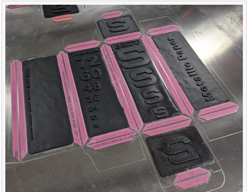
Sttark 3D Print Technology for Embossing Folding Cartons

GREENVILLE, SC, USA, August 16, 2024 /EINPresswire.com/ -- Sttark, a leading provider of custom-printed packaging solutions based in Greenville, SC, continues to expand its custom folding carton offerings with the introduction of embossing options. This enhancement, driven by growing customer demand, marks a significant milestone as the company celebrates the two-year anniversary of launching its dedicated cartons business.