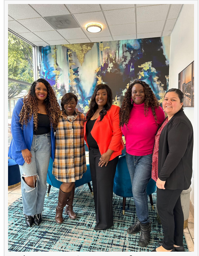
A Photo Featuring Some of Connect 2 Rise Inc. Board Members

While new backpacks and supplies are important, many teens still lack the emotional and mental well-being support needed to feel acknowledged or valued amid overwhelming demands. According to