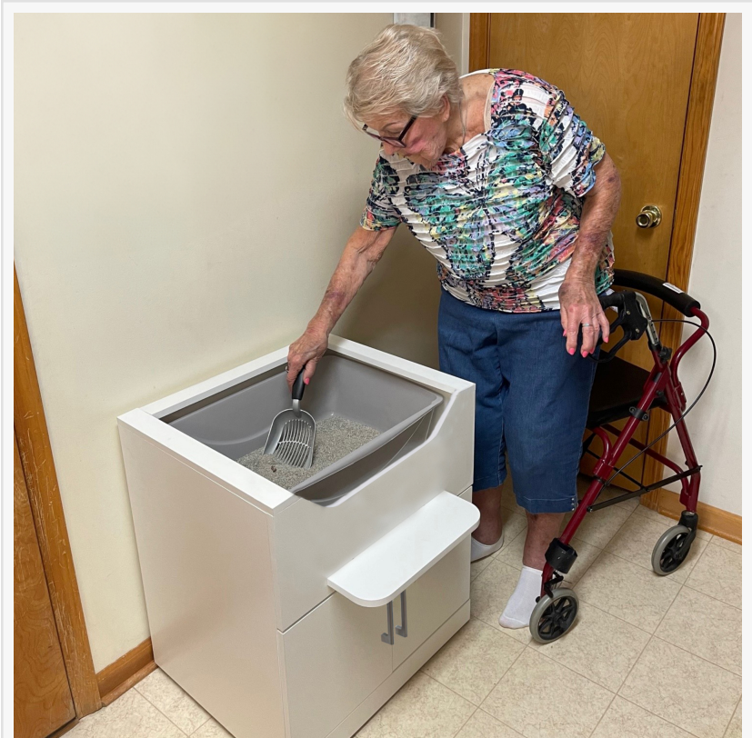
Elderly cat owner safely stands to clean LoftyLoo Raised Litter Box

Ergonomic Design: Independence for the Disabled and Elderly