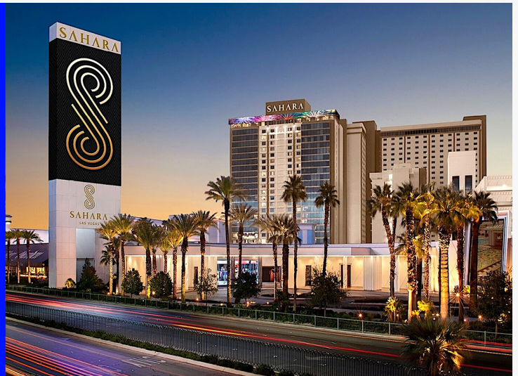
Sahara Las Vegas