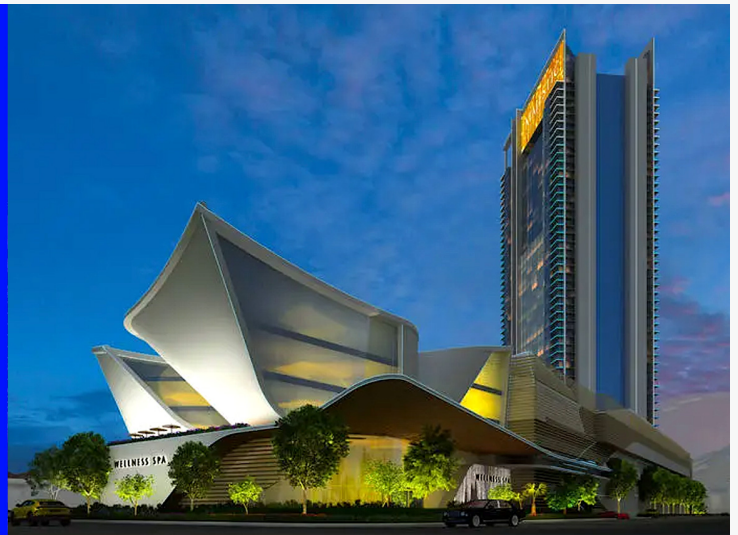
Majestic Las Vegas