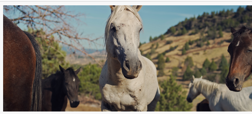
A Family of Cultural Heritage Horses

More about Wild Horse Fire Brigade: <a href="https://www.WildHorseFireBrigade.org">https://www.WildHorseFireBrigade.org</a>