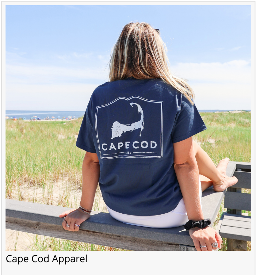
Cape Cod Apparel