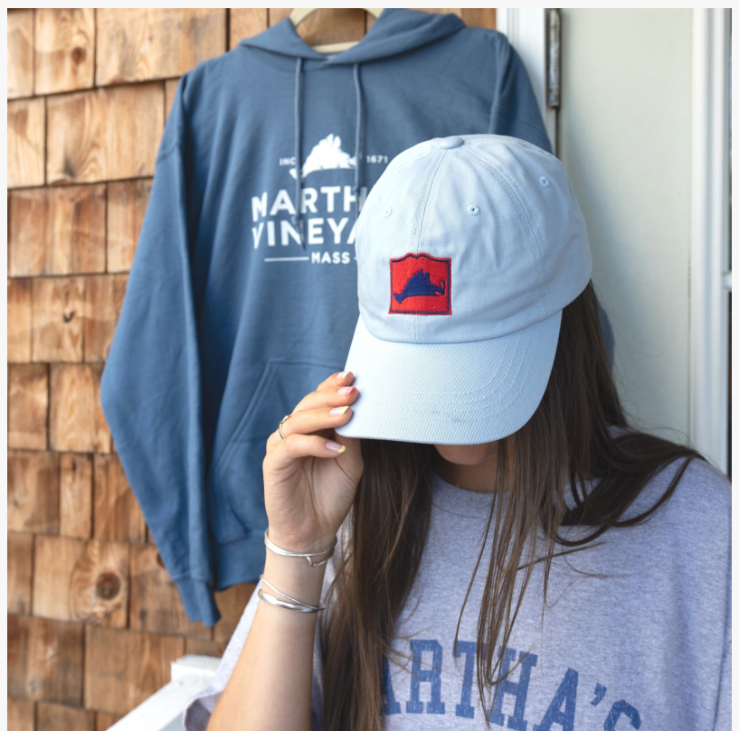
Martha's Vineyard Apparel

This press release can be viewed online at: https://www.einpresswire.com/article/736410181