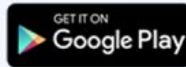
App & Play Stores