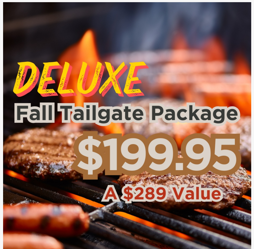
Deluxe Fall Tailgate Package