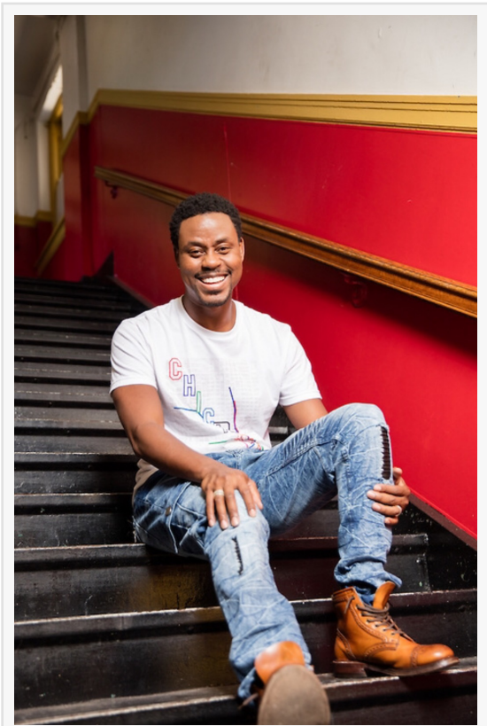
Charles Jenkins

This press release can be viewed online at: https://www.einpresswire.com/article/736448398