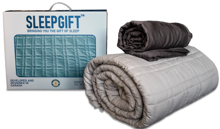
SleepGift's Weighted health blanket with Far Infrared Rays

reduced appearance of fine lines and wrinkles, and