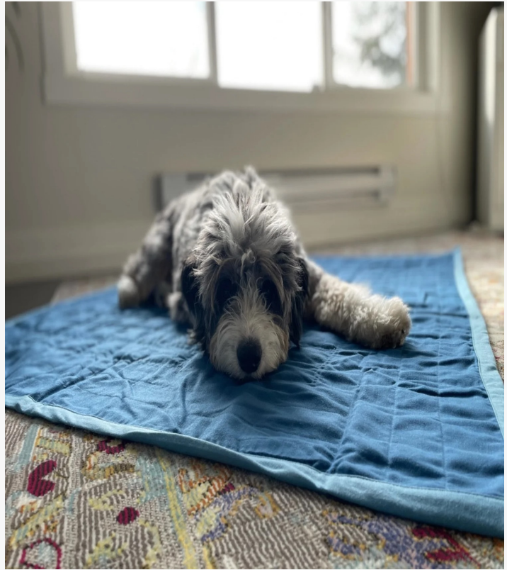
Health Pads for Dogs , cats and pets

FIR therapy can improve skin health by increasing collagen production and enhancing cellular regeneration. This can lead to a more youthful complexion, reduced appearance of fine lines and wrinkles, and