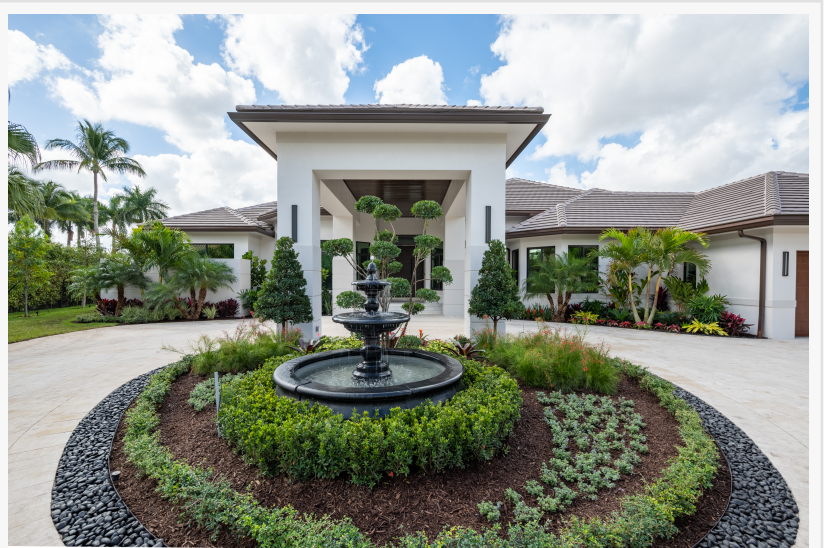
Fort Lauderdale General Contractor

The process of building or remodeling a home is a significant investment, both financially and emotionally. Homeowners in South Florida must navigate a complex landscape, where the combination of local building codes, environmental considerations, and the desire for luxurious, custom designs requires the guidance of a knowledgeable and experienced general contractor. Engaging a contractor with a deep understanding of these factors can make the difference between a successful project and one that falls short of expectations.