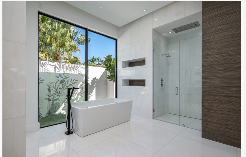
General Contractor Fort Lauderdale