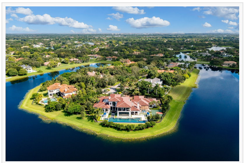
Home Builder Plantation

The process of demolishing an existing structure and constructing a new, custom home requires careful planning and a deep understanding of local regulations, market trends, and community aesthetics. In Broward County, areas like Weston, Davie, Southwest Ranches, Coral Ridge, Las