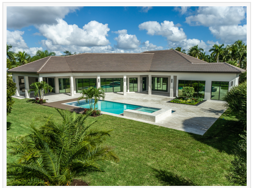
luxury home builders waterfront

In <u>Coral Ridge, Las Olas Isles, and Rio</u> Vista, where waterfront properties dominate the real estate market, Thomas Homes advises careful evaluation of factors such as flood zones, seawall requirements, and the impact of rising sea levels on new construction. These neighborhoods, known for their luxurious homes and scenic views, demand a builder who is not only skilled in construction but also well-versed in the specific