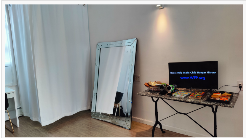
See Yourself at Reimagined BK

The store will also feature a versatile space that doubles as a showroom for local artists and designers. Reimagined BK is designed to be flexible and transformable, accommodating intimate