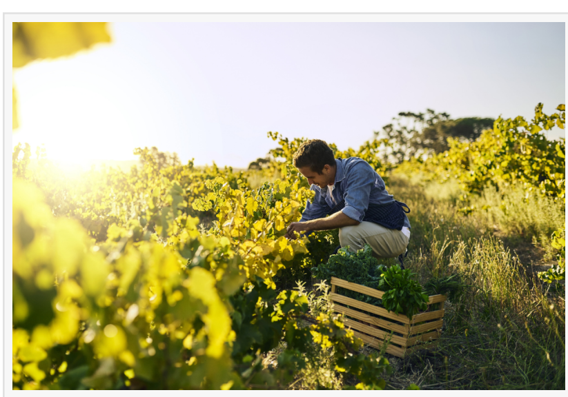
Person harvesting produce

ZüRICH, SWITZERLAND, August 20, 2024 /EINPresswire.com/ -- Haelixa and regenagri have joined forces to spearhead the advancement of regenerative agriculture. Their innovative approach to monitoring and improving regenerative farming systems and ensuring the integrity of the supply chain using forensic science. Central to this approach is DNA