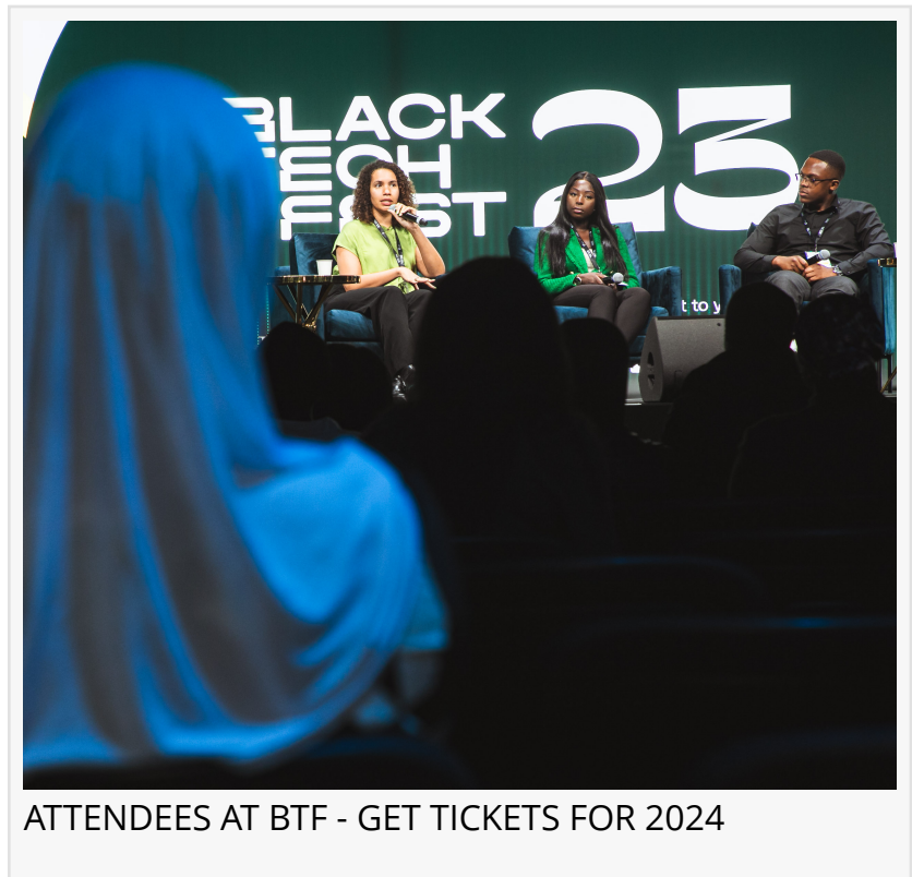
ATTENDEES AT BTF - GET TICKETS FOR 2024

"We are incredibly excited to partner with such influential and forward-thinking companies for