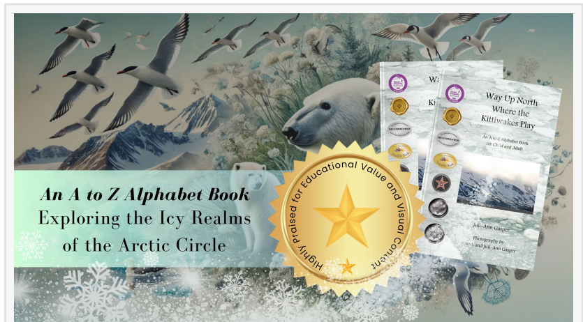
Way Up North Where the Kittiwakes Play: An A to Z Alphabet Book for Child and Adult By Juli-Ann Gasper

Way Up North Where the Kittiwakes Play is now available for purchase. For more information or