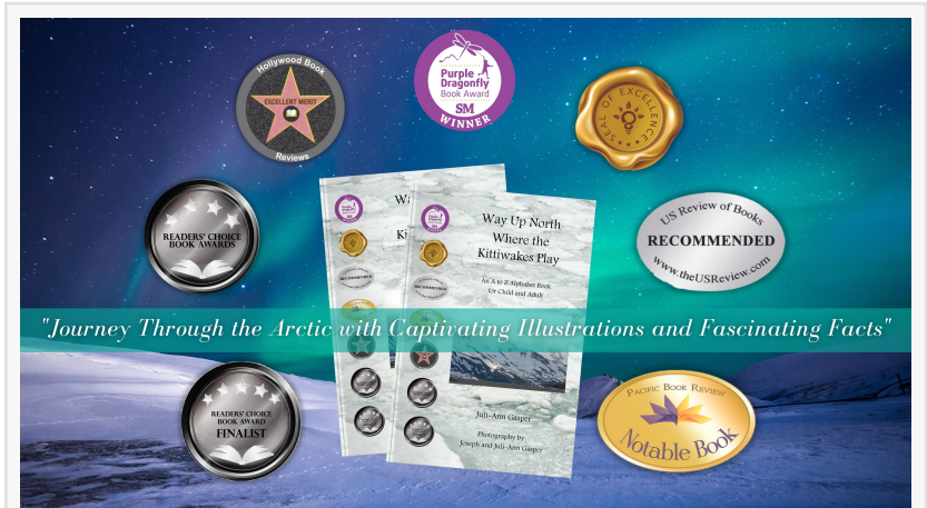
Way Up North Where the Kittiwakes Play: An A to Z Alphabet Book for Child and Adult