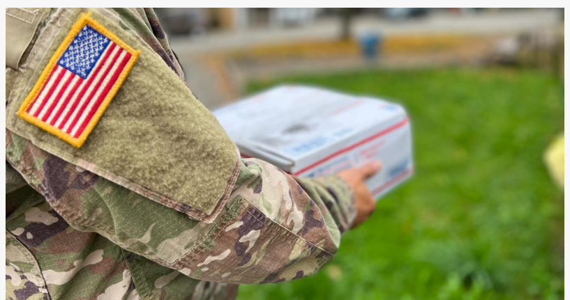
US Service Member Holding a Care Package

This electronic submission process is critical for ensuring that the package clears customs quickly and without issues. Failing to comply with these requirements can result in the package being returned to the sender, often at their expense, with no refund for the postage. Additionally, vague or incomplete item descriptions on the customs forms—such as simply listing "snacks" or "hygiene products"—can lead to the package being flagged for further