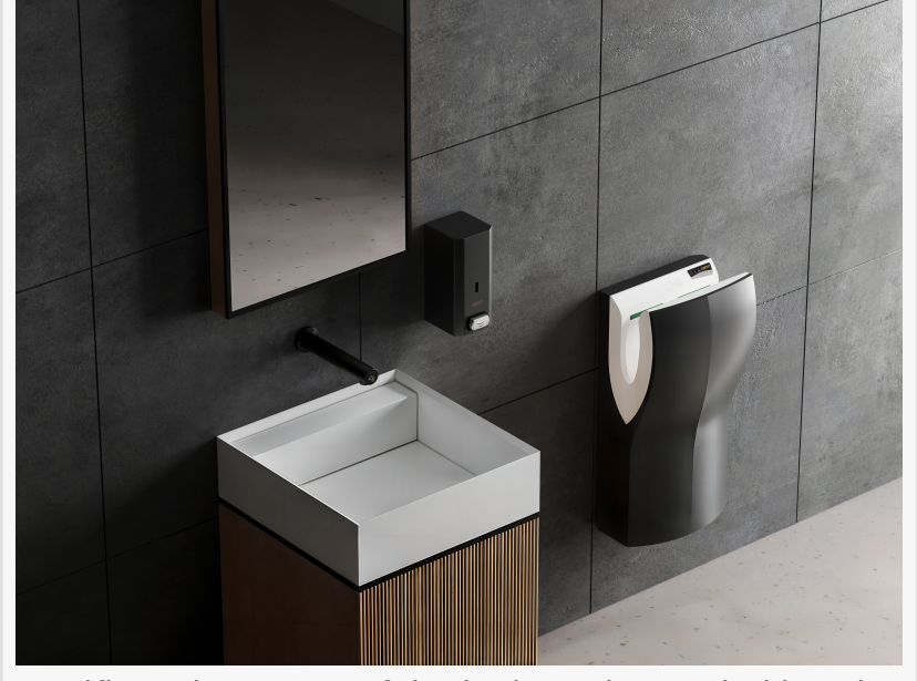
Dualflow Plus is one of the highest demanded hand dryers currently on the market.