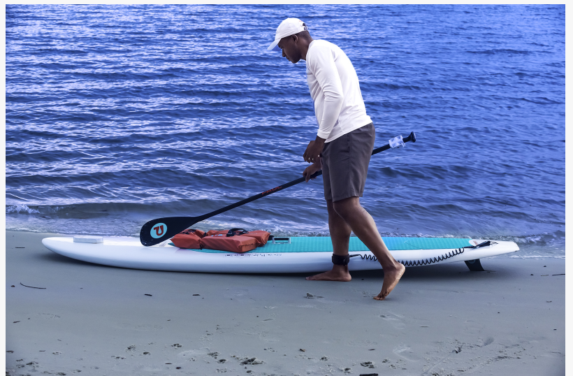
Water sports are a great way to get in touch with nature while getting in a workout.