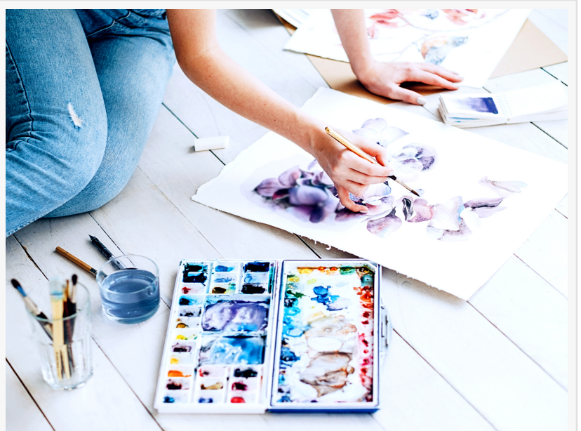
Nab some "me" time with the watercolors

Given these statistics, maybe the new approach proposed by Life of Self Improvement makes