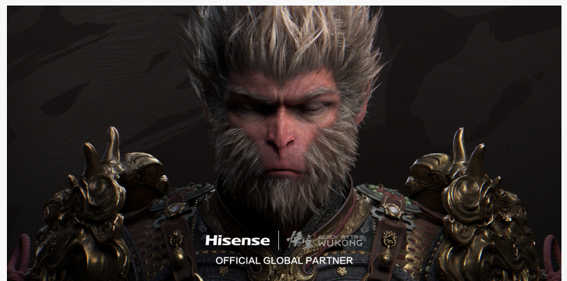
Hisense Partners With Black Myth: Wukong To Elevate The Gaming Experience

The Black Myth: Wukong picture mode is available on Hisense UX, U8N, U7N, and S7N series as