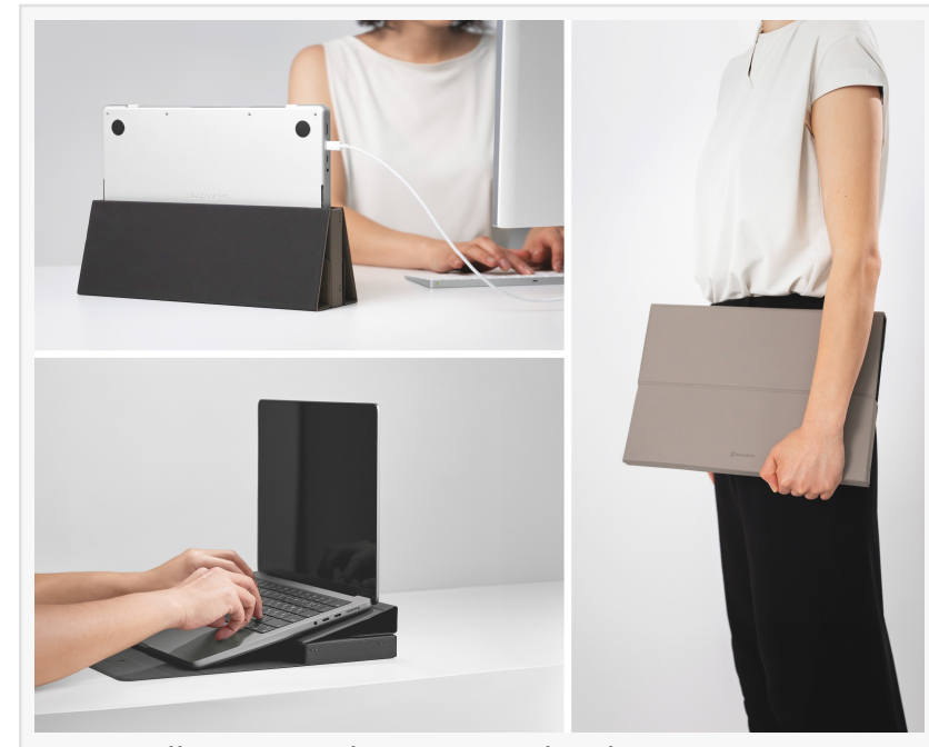
Trinity all-in-one solution seamlessly integrates a vertical stand, 15-degree and 30-degree stands, a portfolio bag, and a carrier bag.

☐ 30 degree Stand Mode is designed for use on the lap or as a second monitor on the desk for best viewing height.