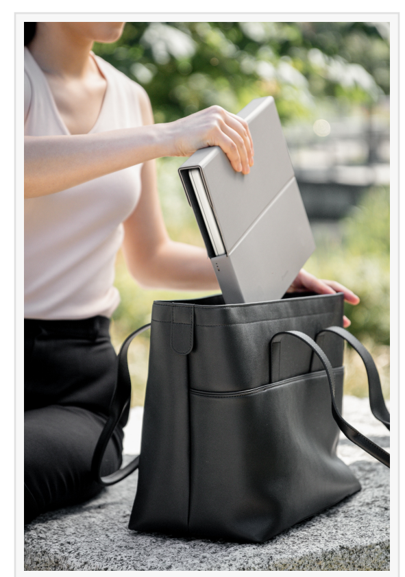
SleekStrip Introduces Trinity: A Minimalist, Multifunctional 5-in-1 Standing Laptop Sleeve on Kickstarter

The Trinity Standing Laptop Sleeve was designed to simplify the hybrid work experience to further enhance the benefits of remote work, including increased productivity, improved mental and physical health. Looking ahead, according to UpWork, by 2025, an estimated 32.6 million Americans, roughly 22% of the workforce, will be working remotely. The Trinity Laptop Sleeve welcomes the transition of the laptop and its accessories from one work location to another with minimum hassle and clutter with its multiple modes of operation.