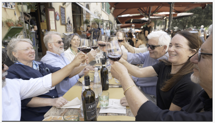
Celebrating the good life together