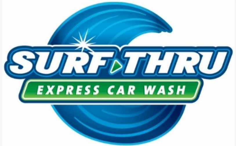
Surf Thru Express Car Wash

The new Surf Thru Express Car Wash boasts cutting-edge technology designed to deliver unparalleled cleanliness and efficiency. With advanced equipment and upgraded cleaning solutions, customers can expect a superior wash that preserves the environment while achieving