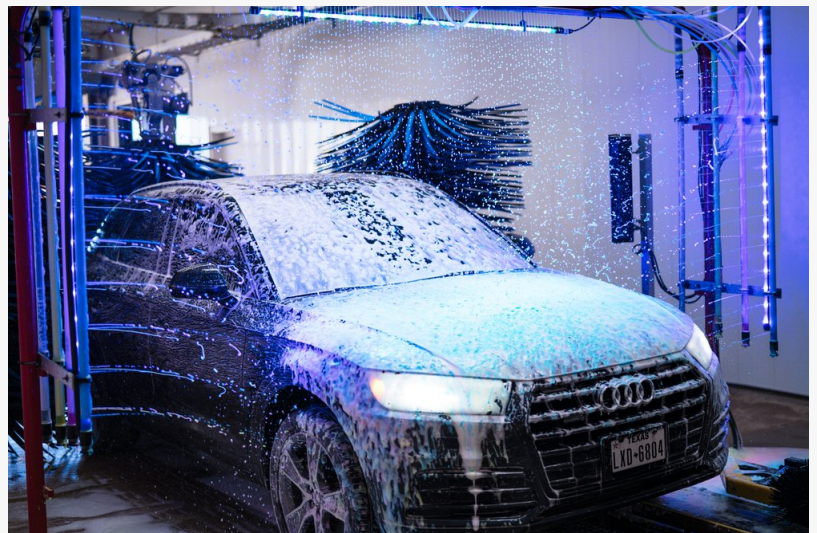
Protect your investment with the power of Graphene!