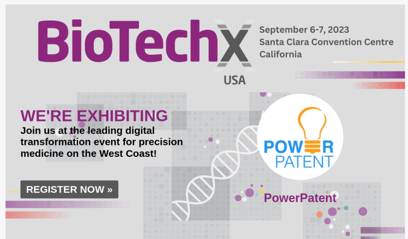
PowerPatent BioTechX First Draft solution for Patents