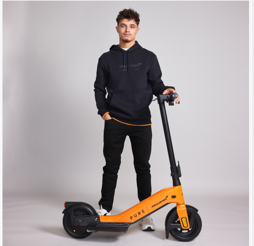
Pure McLaren & Lando Norris