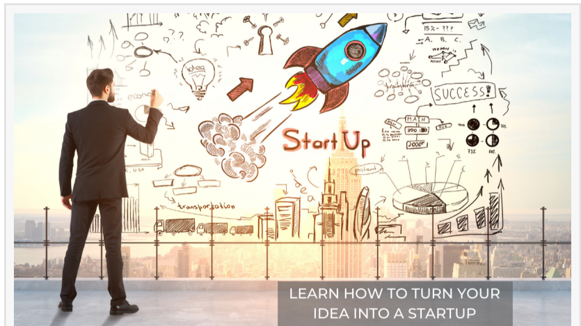
Launch Your Startup and protect your GTM plan

Intelligent routing and matching algorithms can analyze submitted ideas and direct them to the most appropriate reviewers within a company. These algorithms can also match ideas with