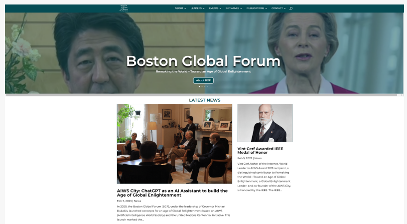
Boston Global Forum

AI tools have revolutionized the process of submitting inventions to companies, making it more efficient and effective for both inventors and organizations. These tools offer a range of capabilities that streamline various aspects of the invention submission process.