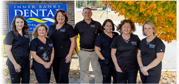
Inner Banks Dental staff