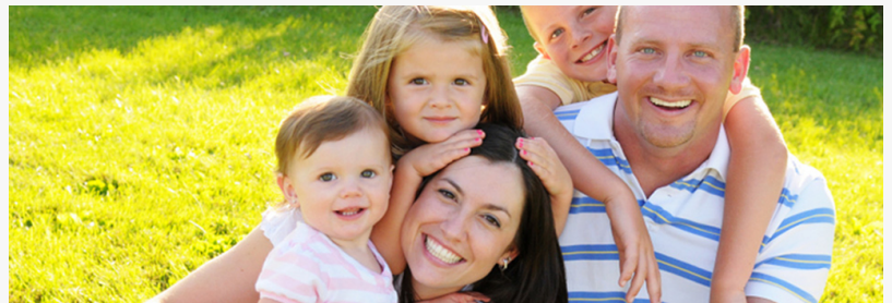
Inner Banks Dental