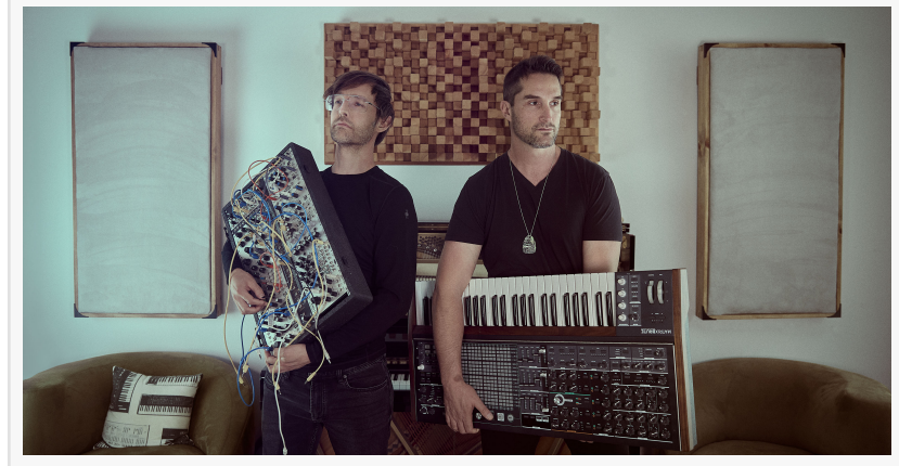
Idle Echoes' Jeff Dodson and Arkfoo have just released their debut alternative indie pop album, 'Velvet Phoenix."