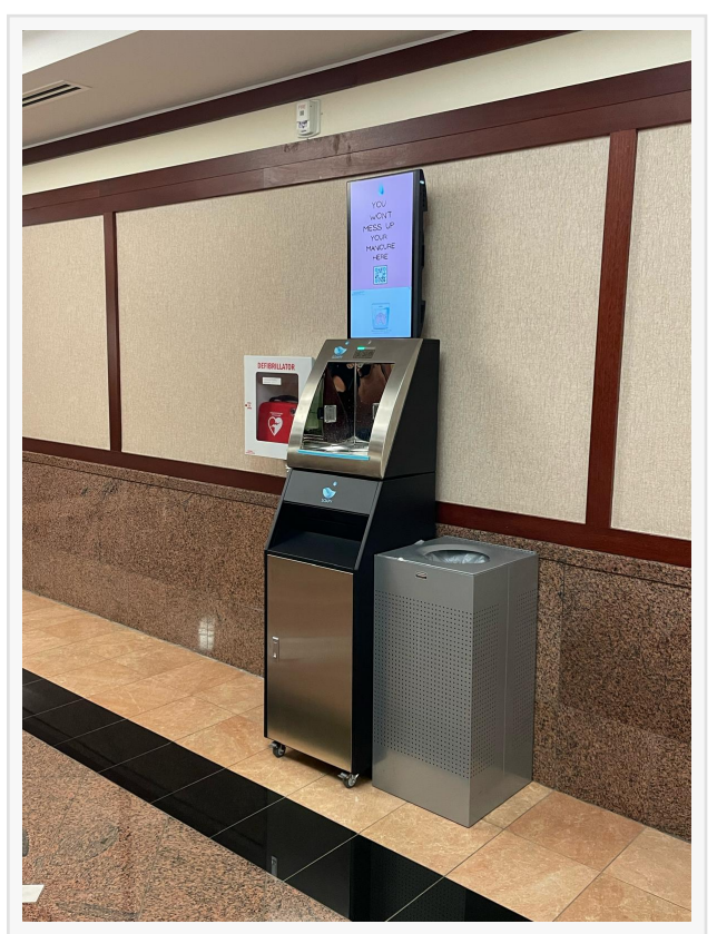
Soapy's intelligent hand hygiene system at the FDU Lobby

The interactive system offers animated visual tutorials and provides instant feedback to ensure adherence to strict infection prevention measures. This initiative is aimed at enhancing patient and public safety, as well as elevating care and infection prevention standards in hospitals, clinics, pharmaceuticals, and senior living facilities.