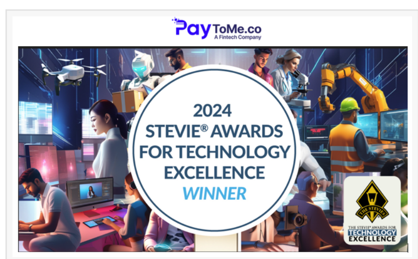
PayToMe.co - Technology Excellence Award-Winner

SILICON VALLEY, SAN FRANCISCO, USA, August 20, 2024 /EINPresswire.com/ -- PayToMe.co, an innovative FinTech company in Al-driven financial solutions, proudly announces its recognition as the Silver Winner in Technical Innovation of the Year at the 2024 Stevie Awards for Technology Excellence, debbed "the Olympics for technology". This prestigious